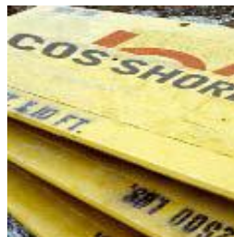
Steel Road Plates