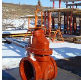
Valve Lifting Tool