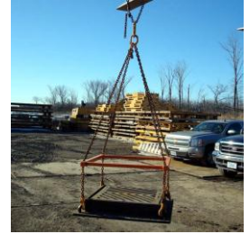
Casting Lifting Tool