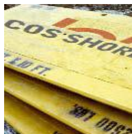
Steel Road Plates