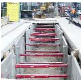
Aluminum Hydraulic Shoring

Please note: The sizes listed are our standard boxes. We do carry custom sizes. Call for more details.