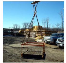
Casting Lifting Tool