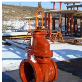
Valve Lifting Tool